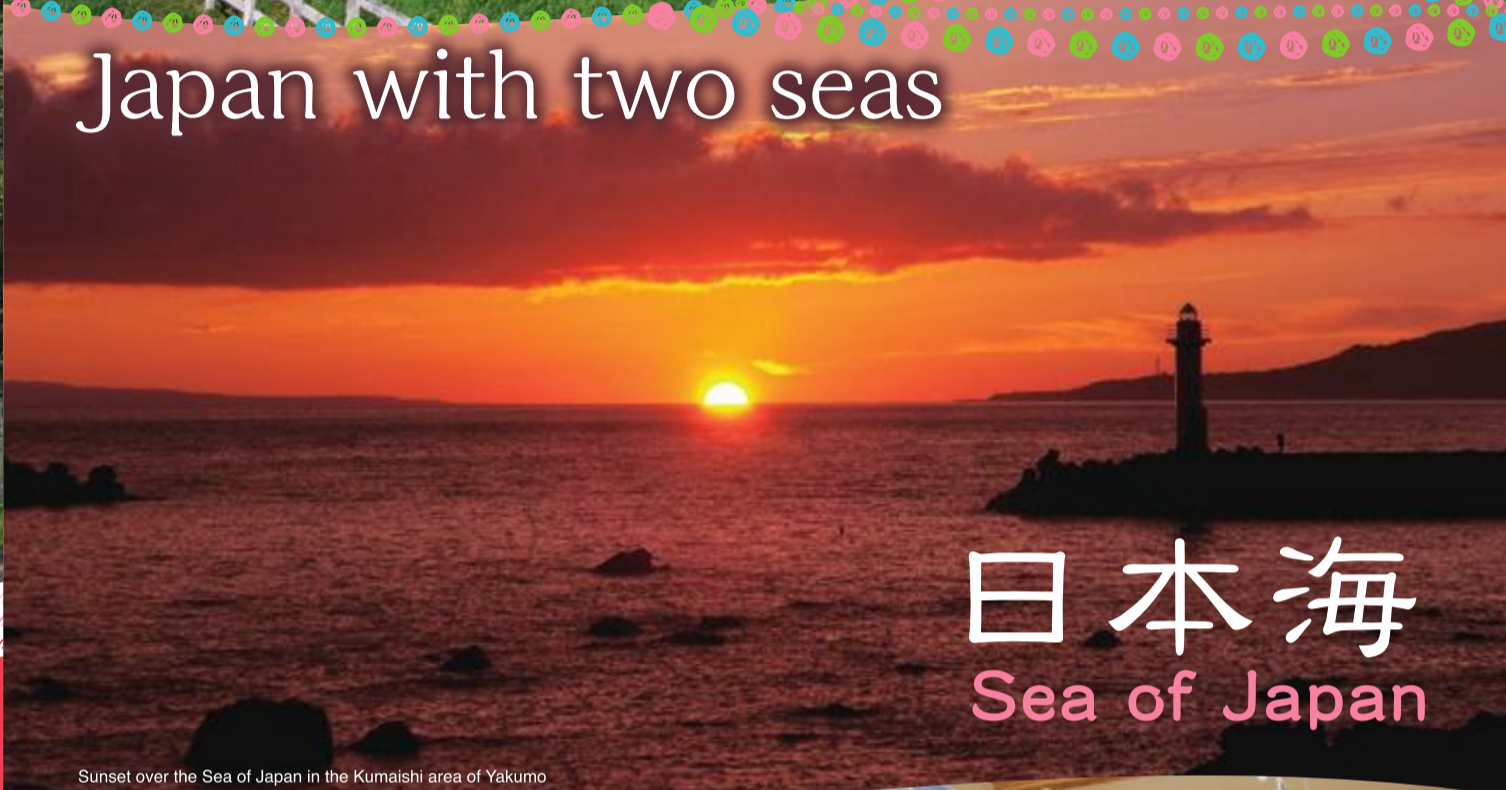
Sunset over the Sea of Japan in the Kumaishi area of Yakumo