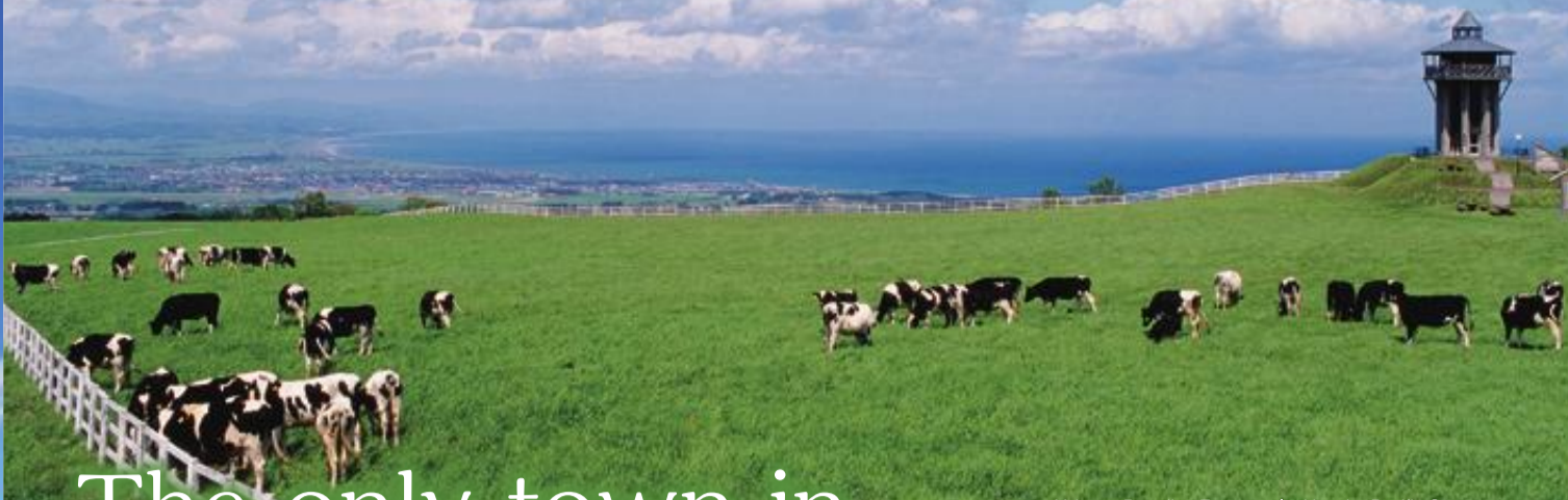
Yakumo Breeding Farm overlooking the Pacific Ocean