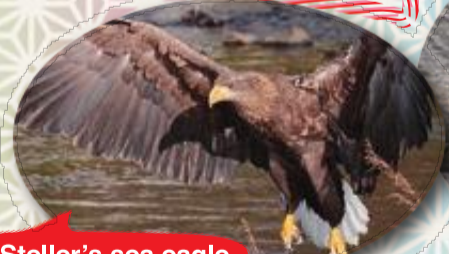
Steller's sea eagle

Steller's sea eagles, the king of the wild birds and "natural monument of Japan" often fly into the area.