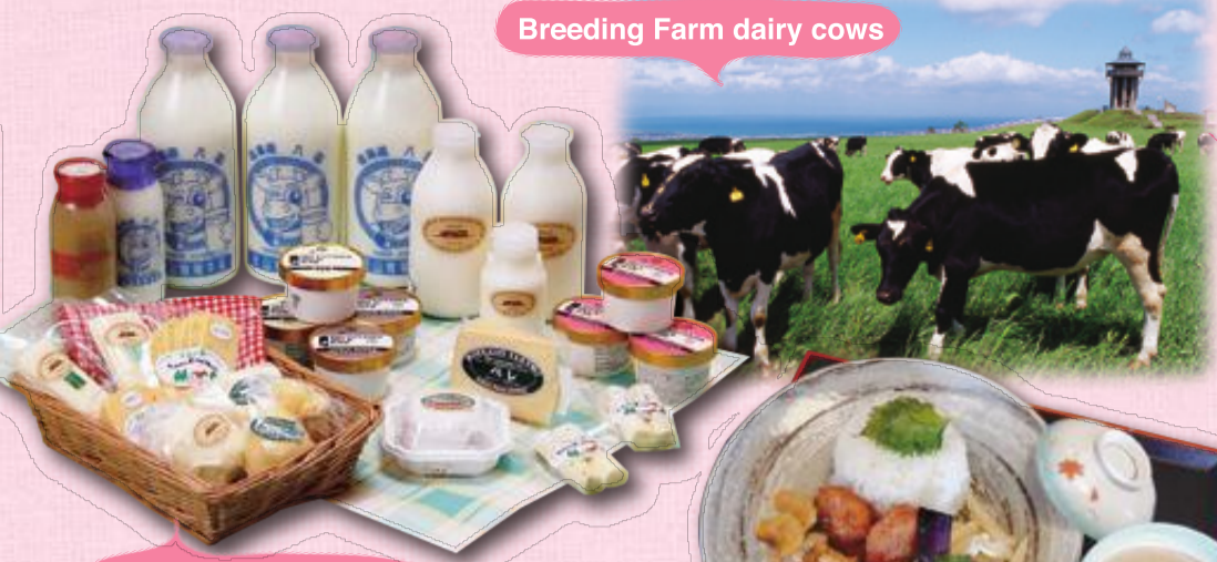
Breeding Farm dairy cows